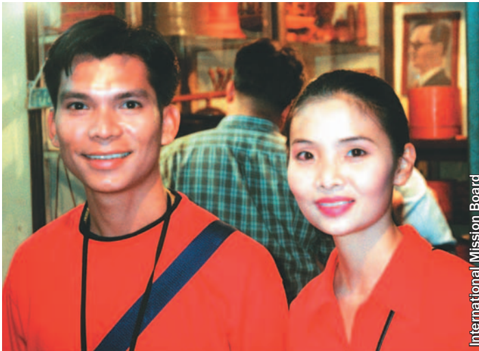
International Mission Board

Interestingly, about 1.5 million of the Southern Thai are Sunni Muslims. The strong Islamic influences come from Malaysia, and also from the 1.5 million Pattani Malays, who live alongside the Southern Thais yet are ethnolinguistically distinct from them. 4