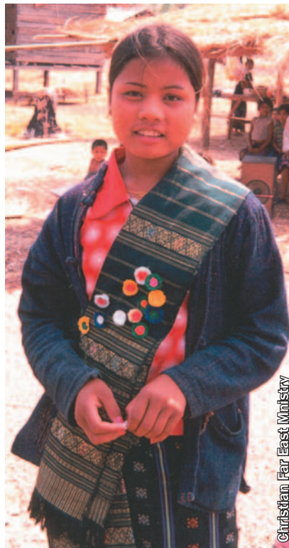
Christian For East Ministry

The Lao Krang are a needy unreached people group with few Christians and minimal exposure to the gospel.