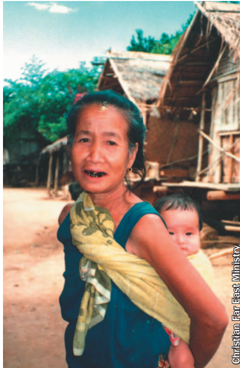
Christian Far East Ministry

long piece of cloth wrapped around the waist and down to the knees, from where it is pulled back between the legs and tucked in at the waist under a silver belt. . . . Old Khorat Thai women report that their mothers decorated themselves with silver anklets and gold armbands and necklaces.’ 5 In the past, Khorat Thai men were skilled hunters of deer, wild pigs and other animals, but these have become all but extinct in the area due to over-hunting. They have been forced to feed their families through agricultural