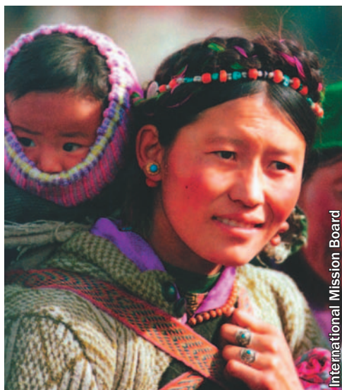
International Mission Board

Written records of Tibetan history have survived from the 7th century AD, but it