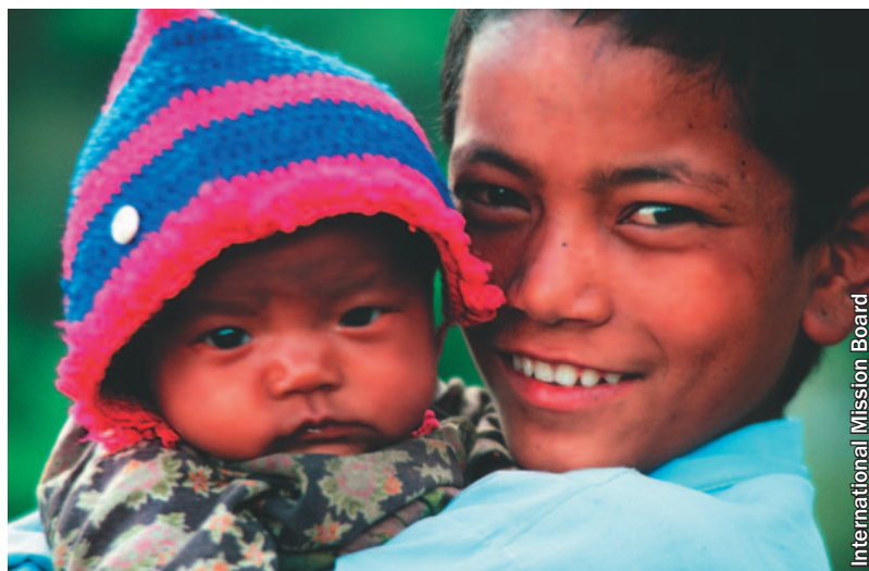
International Mission Board

gompa is Chenrezi. . . . The Walung people have been hit hard by the decline in Tibetan trade and many have migrated to Darjeeling, Kathmandu and Hile. 12 Approximately 1,000 Walung people now live in the Darjeeling District of West Bengal in India.