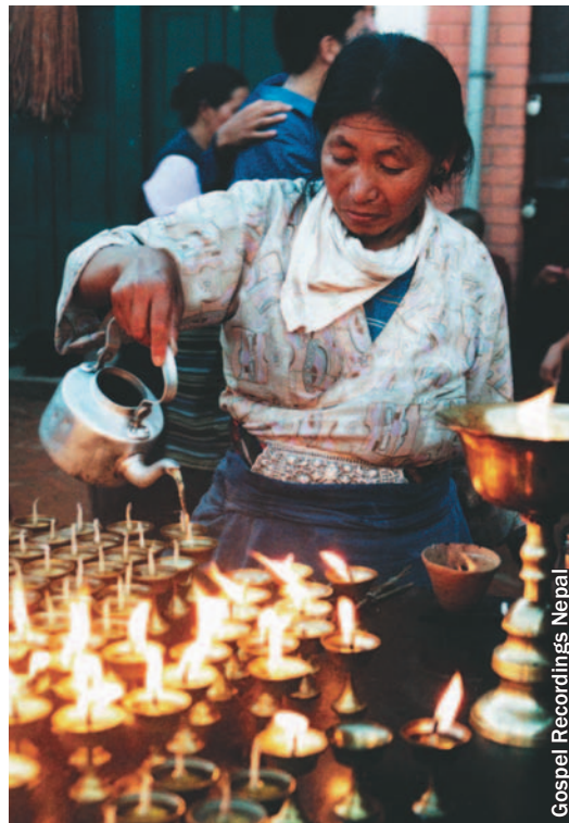
Gospel Recordings Nepal

The Tsum speak a Central Tibetan language, but linguistic studies have shown that it only shares 71 per cent to 78 per cent lexical similarity with Nubri, 60 per cent to 66 per cent with Lhasa Tibetan and 66 per cent with Kyerung. 5 Few Tsum can speak more than a few words and phrases of Nepali. Their isolated mountain hideout has separated them from the main body