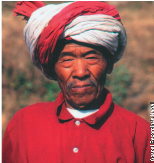
Gospel Recordings Nepal

edibles like rice, curry and pulses are placed all around the corpse. . . . The last rites for the corpse are preferentially done on a hilltop rather than on the river banks and burials are fewer than cremations. While the corpse is being consumed by flames, the lama sits nearby continually reading the sacred scriptures. While this is going on, the lamas are offered food brought along with the funeral procession. This they consume while reading the sacred