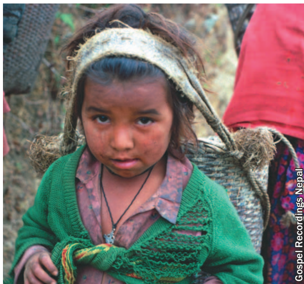
Gospel Recordings Nepal

Although many Southwestern Tamang still profess Buddhism as their religion, Hinduism is making rapid inroads at its expense. Christianity has also experienced explosive growth in recent years. This growth is not without problems and lack of understanding, however. One evangelist was summoned to pray for a woman suffering from acute stomach pain. 'As he approached the house he heard what