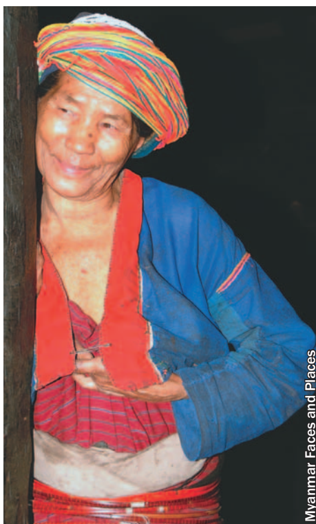
Myanmar Faces and Places

missionary report of a trip to Myanmar in 2003 gave encouraging signs that God is quietly working among Palaung people. The report said, 'We found individuals and pockets of Palaung who were believers in several areas. Some live in conditions as described in Hebrews 11:38. Some of their children have died from malaria, which is rampant near rivers and brooks. They hardly have enough to survive. . . Their faces lit up when we came and they were very glad to have people come to help share the Good News with their friends, who are still in fear of hell and demonic forces, which they believe live inside trees and rocks.' 4