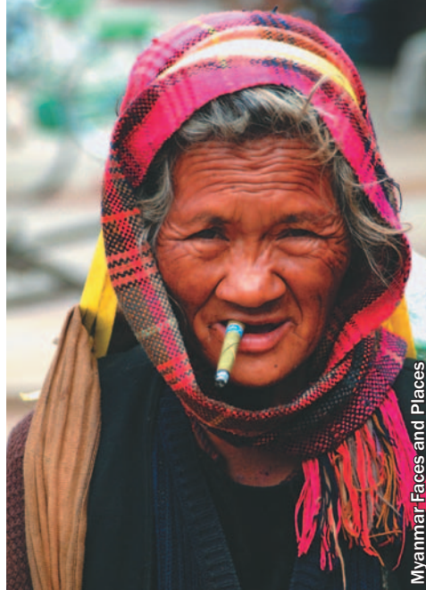
Myanmar Faces and Places