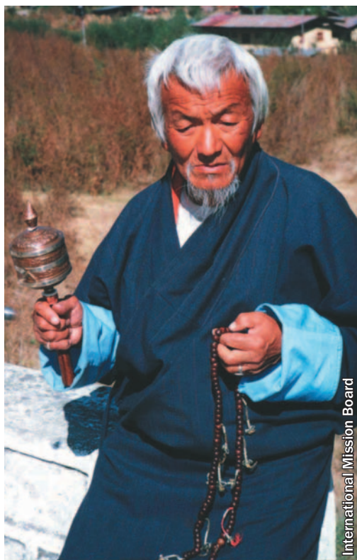
International Mission Board

Population: 370 (2000) 480 (2010) 620 (2020) Countries: Bhutan Buddhism: Tibetan Christians: none known