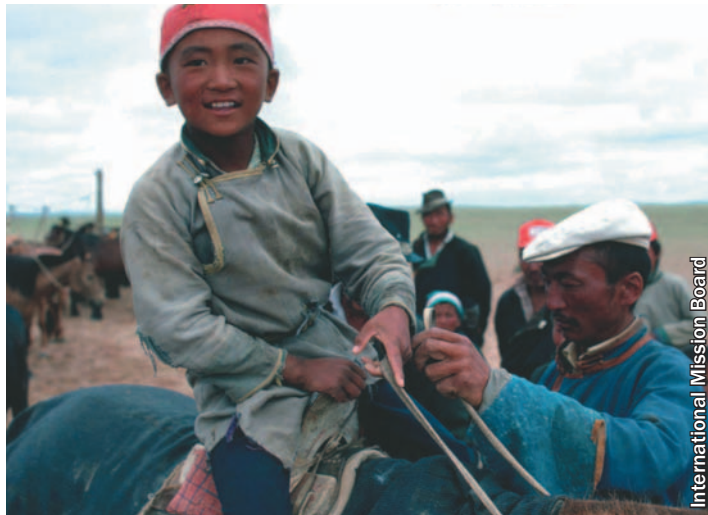
International Mission Board

When the Yugur first arrived in the area in the 9th century they believed in Manichaeism. The Tibetans soon converted them to Buddhism. Today most Yugur remain