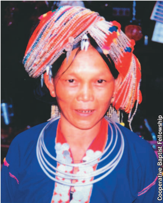
Cooperative Baptist Fellowship

The Rumai Palaung still view Christianity as a strange religion. They believe that they have the truth in Buddhism, and they are fearful of the spiritual consequences if they should change their religion and stop appeasing the demons that they and their ancestors have been enslaved to for hundreds of years.