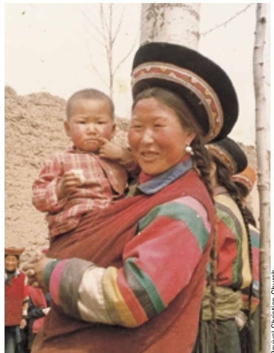
Revival Christian Church

Christianity: By the 1920s Catholic missionaries were active in the Mongour region, but no church remains today. Although most Mongour can read, there are no Scriptures available in their language. Missionary Frank Laubach issued a warning to the Church in the 1930s: "Millions in China will soon be reading. Are we going to give them reading matter? Will they be flooded with the message of Christ or with atheism? Will they read love or hate? This is the most stupendous, most arresting, most ominous fact, perhaps on this planet." 7