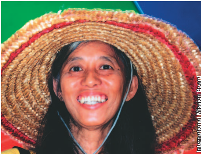
International Mission Board

The long history of religious observance among the Chuanqing is evidenced by the presence of several ancient temples in the Anshun area, including the Wen Miao Confucian Temple built in 1368, the Buddhist White Pagoda dating from the Ming Dynasty, and Tian Tai Shan Buddhist Temple built in 1616. Today approximately half of the Chuanqing people claim to be Buddhists, although the number of practising Buddhists is much lower. One of the most important Chuanqing festivals is called 'Crossing the River'. Its Buddhist origins tell a tale of when a woman was banished by the king of hell to the lowest