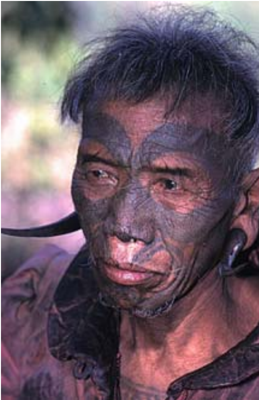
Waiting to hear the Gospel... A heavily-tattooed man from the Wancho tribe in Arunachal Pradesh.

I continued to follow Jesus. I told them I must follow Him, because He is real and he raised my son from the dead!