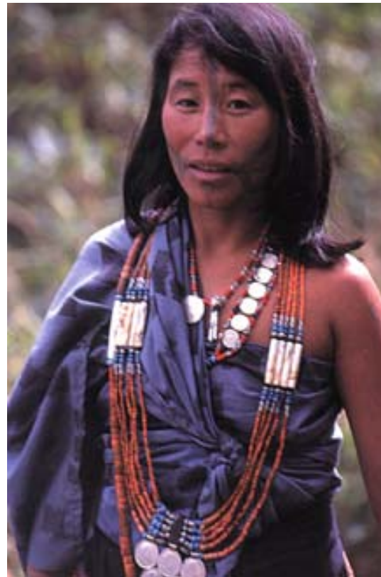
A woman from the Nocte tribe in Arunachal Pradesh. The Nocte are one of about 60 tribes in this little-known part of Asia.

I then heard the Lord say, "God opposes the proud and gives grace to the humble."